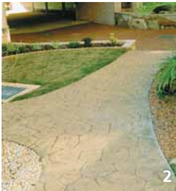
2 Above: A random rock finish creates an attractive walkway. Mat Design:- CCS Large Random Stone Mat Colours to use to achieve a similar look:- CCS Sandy Beige with CCS Rustic Brown Release Agent.