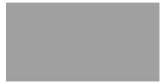
CCS SHALE GREY