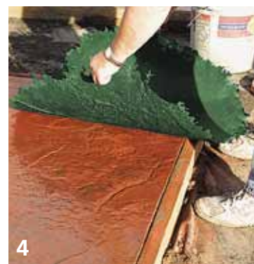
4 The patterned finish is created by placing the mats on the surface of the coloured concrete whilst it is still in its 'wet' state. The CCS stamping mats can also be used on fresh, integrally coloured concrete.