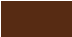
CCS RUSTIC BROWN