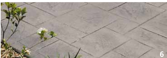
6 The 'naturally appealing' slate patterns are both timeless and practical, particularly for driveways. Mat Design:- CCS Ashlar Slate Mat. Colours to use to achieve a similar look:- CCS Storm Grey with CCS Dark Black Release Agent.