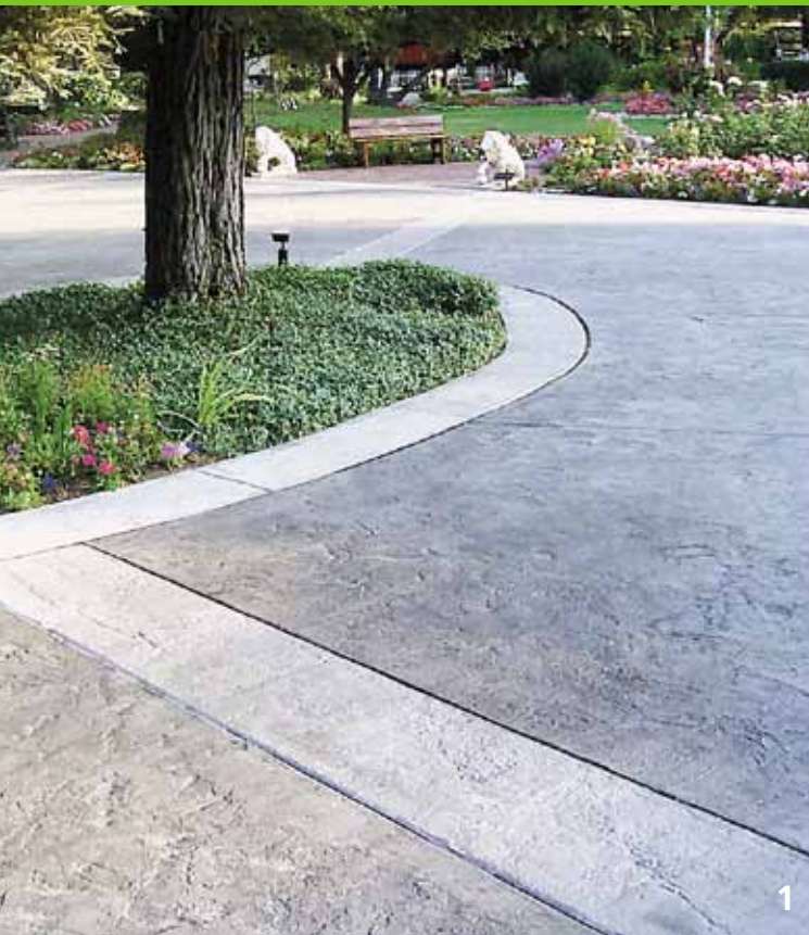
1 This continuous rustic 'pattern-scape' is possible with the CCS Sierra Seamless Stone mat. Colours to use to achieve a similar look:- CCS Storm Grey and CCS Shale Grey with CCS Black Release Agent.

For more information on the patterns and colours available, (including our complete range of pigments for integrally coloured concrete), please talk to your local applicator or visit www.concretecoloursystems.com.au .