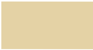
CCS SANDY BEIGE