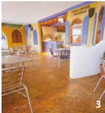
3 Above: This indoor café has been given added charm and character with the CCS Seamless Rough Stone finish. Colours to use to achieve a similar look:- CCS Terracotta and CCS Dark Terracotta with CCS Storm Grey Release Agent.