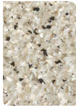
GALAXY GREY GRANITE BASE WHITE / LIGHT GREY