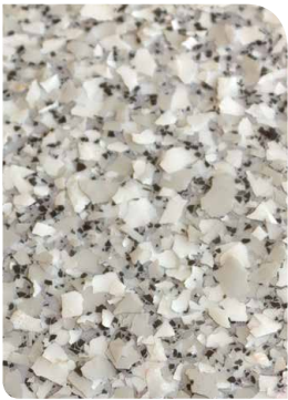
GALAXY MOONLITE BASE WHITE / LIGHT GREY