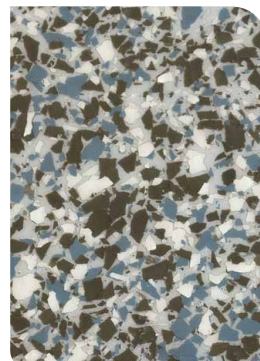
GALAXY GREY MIST BASE WHITE