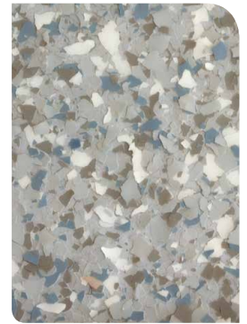
GALAXY GLACIER BASE WHITE / LIGHT GREY