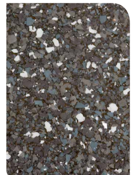
GALAXY BLACK GRANITE BASE BLACK