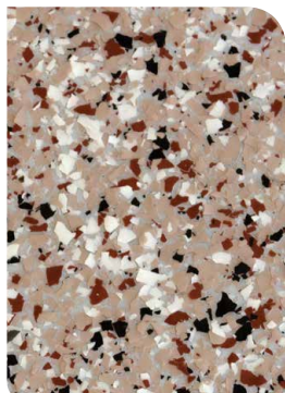
GALAXY GRENADINE BASE WHITE