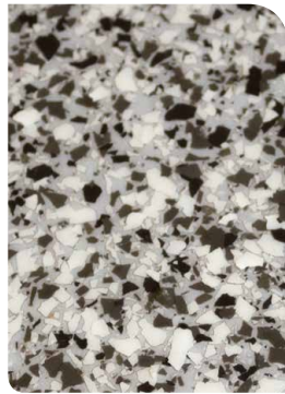
GALAXY ASH GREY BASE WHITE / LIGHT GREY / BLACK