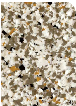
GALAXY DRIFTWOOD BASE WHITE