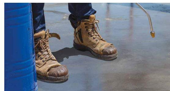
Low pressure spray application