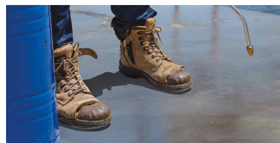
Low pressure spray application